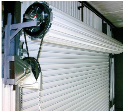
Roll up door showing gearing and pulley method for manual opening & closing (no trough or shroud enclosure on this photo)

In contrast to an overhead type of garage door, be it sectional or single panel, roll up doors have a totally different type of operating system. When these doors are used, they can be concealed in an overhead or under mounted trough. These doors operate similarly to a roll top desk door except for how they are stored when not in the closed position. They normally coil as they are retracted, and require significant gear trains to reduce the effort required to move these doors up and down into position. Often the forces needed to move these roll up doors require a reduction type of transmission that allows a very heavy door to be operated effortlessly. These doors can be chain driven either manually, or can be automated using electric motors. Roll up doors require more frequent evaluation and servicing than a standard overhead garage door. The tracks that are mounted vertically on both sides of the garage opening need maintenance and cleaning more frequently, and are often blocked by foreign obstructions or damaged by collision of some type. These roll up doors are often held open by some type of ratcheting action. Proper balancing of these doors is often more important than an overhead type of door, as the weight of these type of doors is normally much greater than an overhead door.